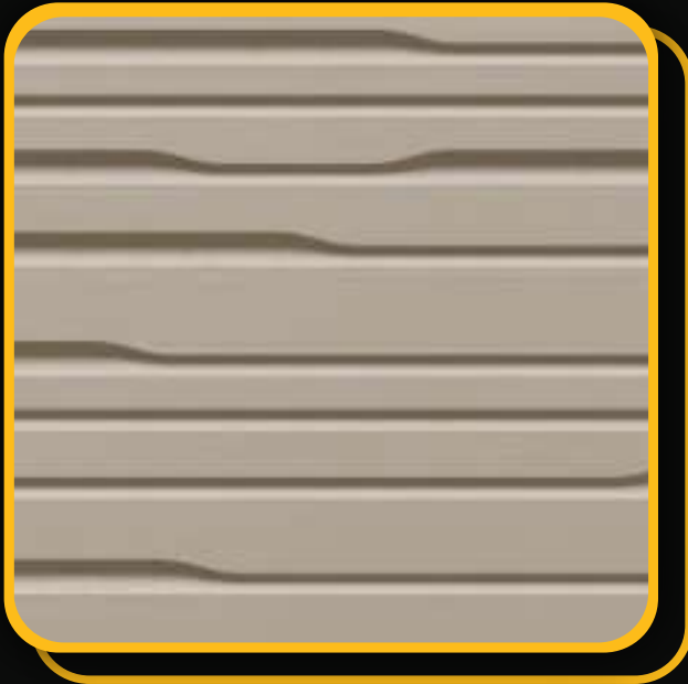
2'x 2' Picture Area