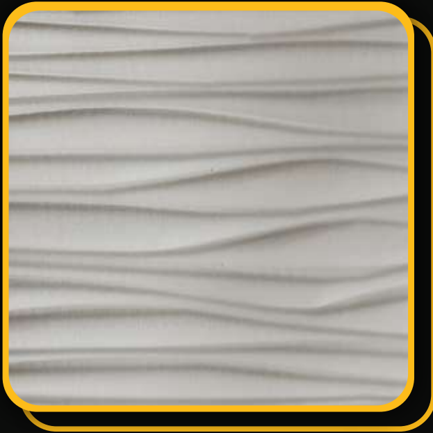
2'x 2' Picture Area