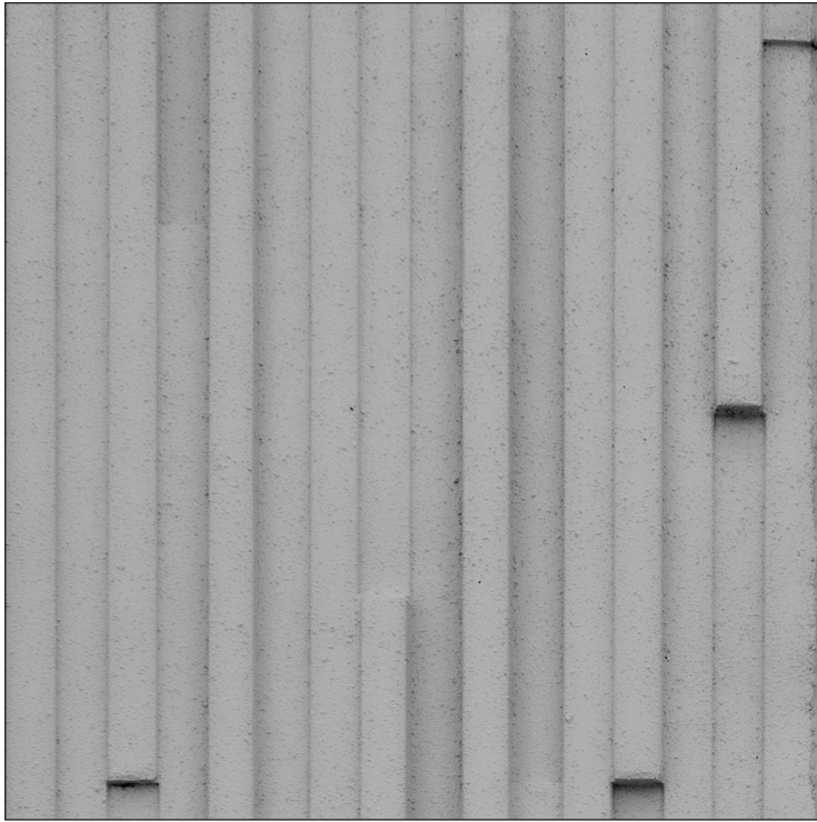
2' x 2' Picture Area