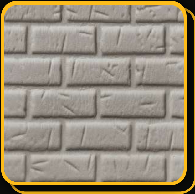
2'x 2' Picture Area