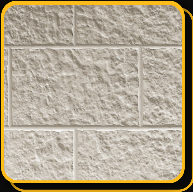
2'x 2' Picture Area