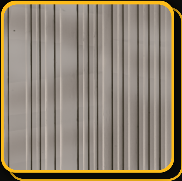
2'x 2' Picture Area