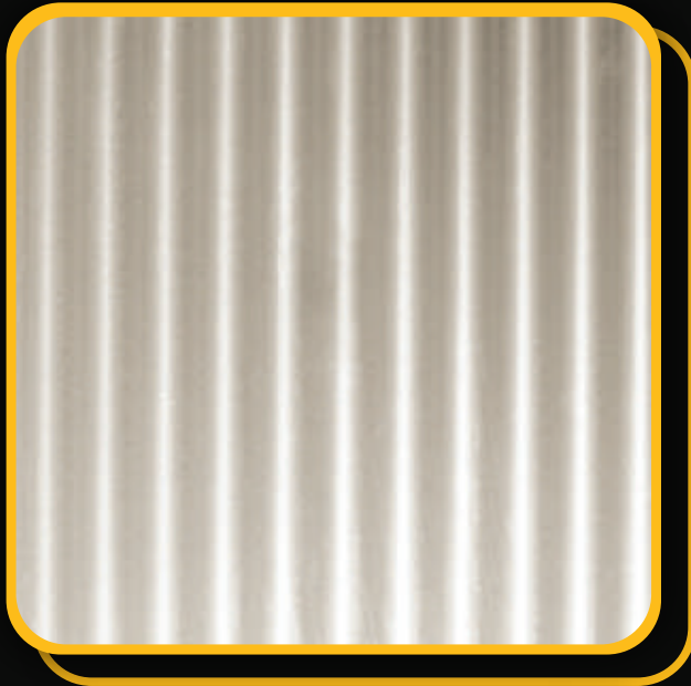
2'x 2' Picture Area