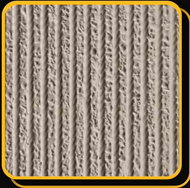
2'x 2' Picture Area

1/2" Fractured Rope Rib (2" OC Rope Rib, 1" peak, 1" rib, 1/2" relief)