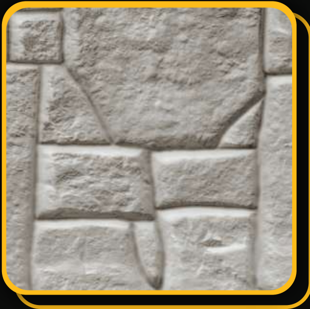
2'x 2' Picture Area