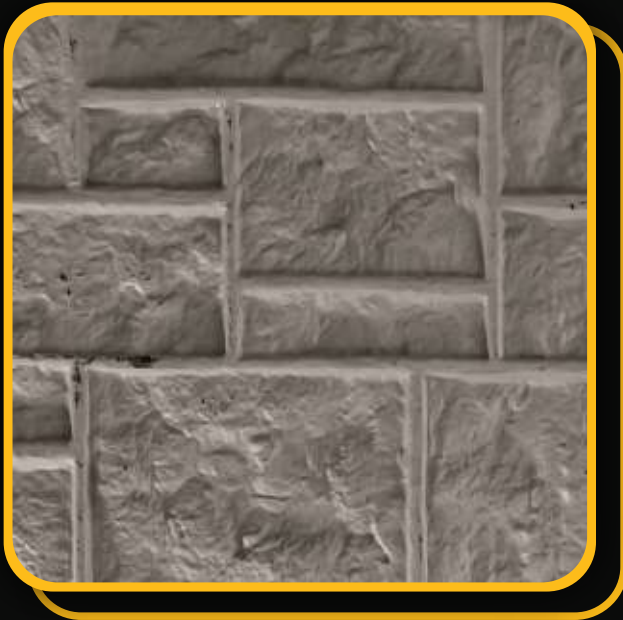
2'x 2' Picture Area